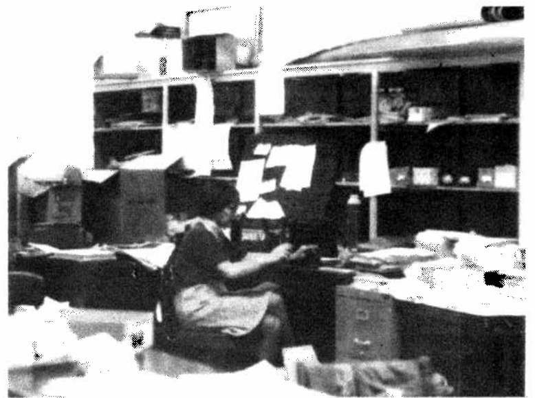
McGovern volunteer mans phone to answer questions and encourage voters to cast their ballots for the Democratic candidate.

have served as a major source of voter registration, but this year they have put off the effort; thus, the burden has rested on the campaigners.